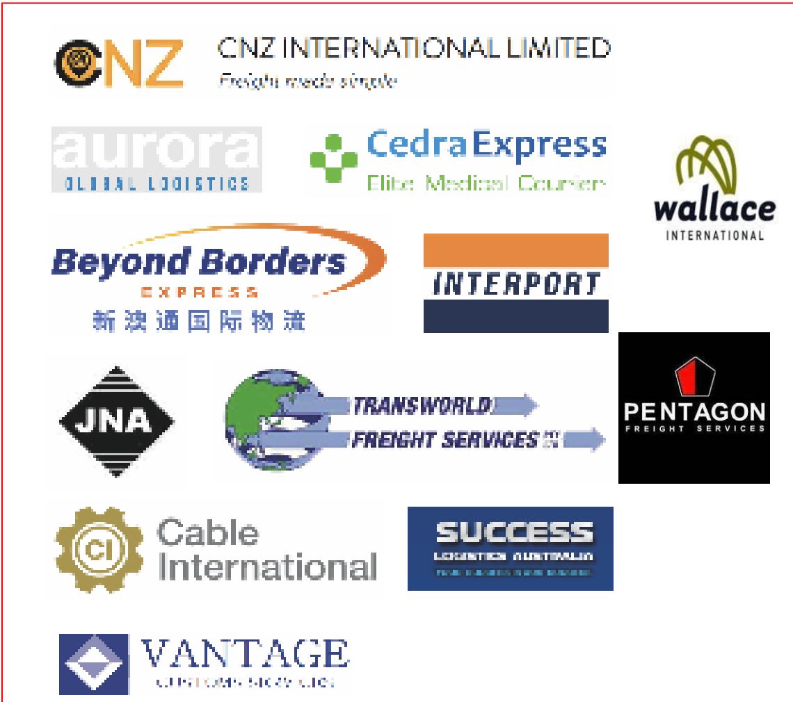
AUSTRALIA & NEW ZEALAND